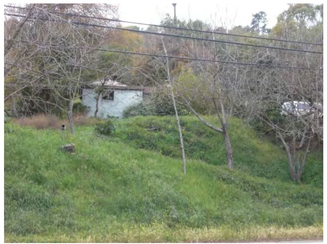
1. 3705 Coldwater Canyon from street