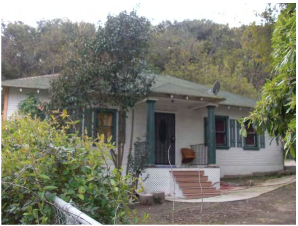
3. 3705 Coldwater Canyon front façade