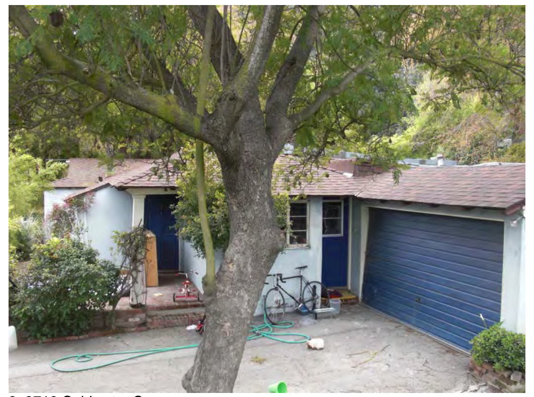
8. 3719 Coldwater Canyon