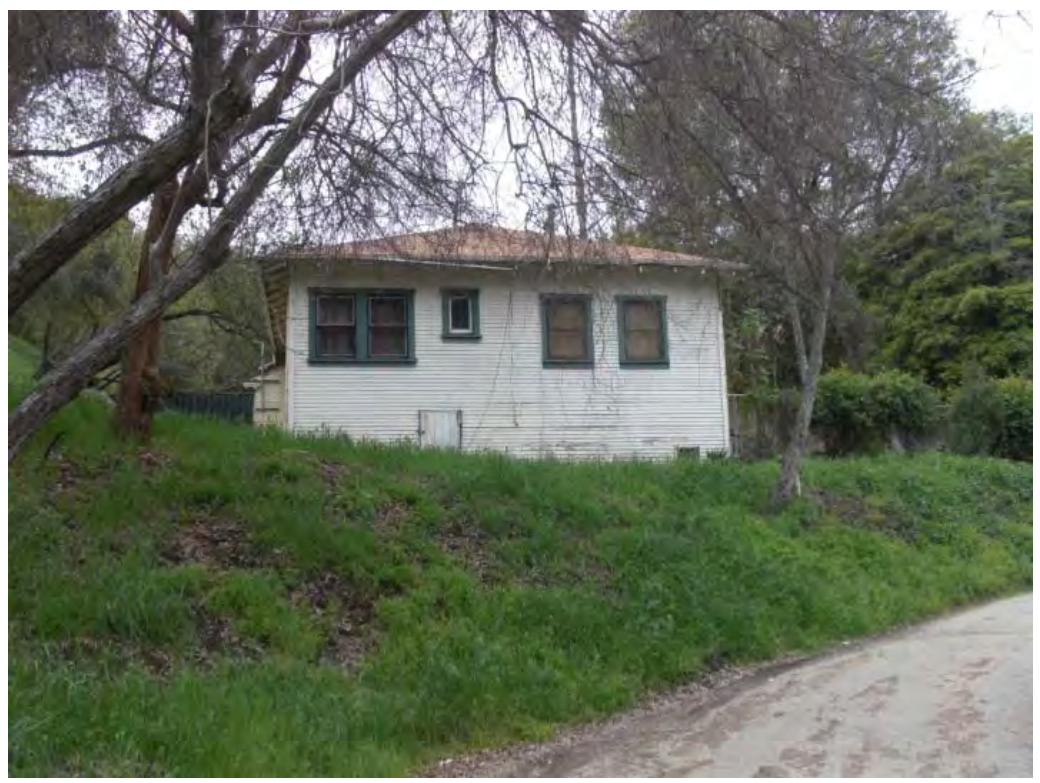
5. 3705 Coldwater Canyon north elevation