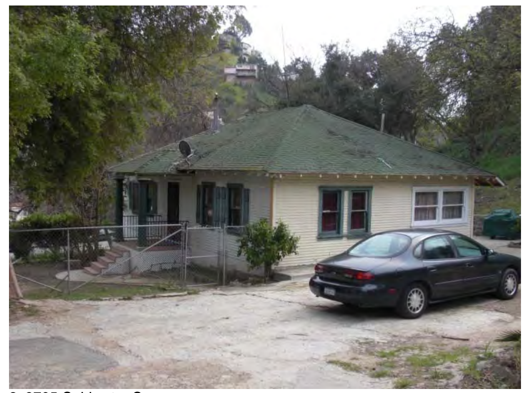
2. 3705 Coldwater Canyon