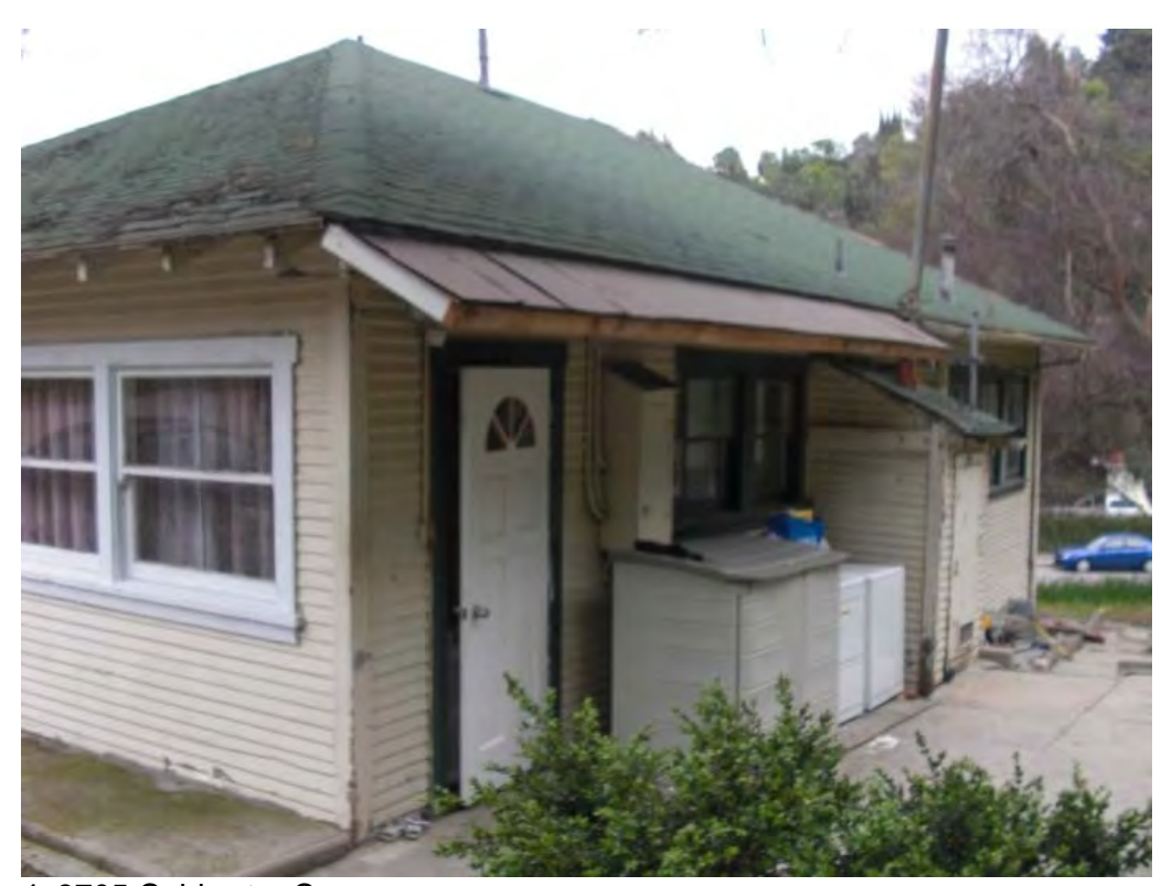
4. 3705 Coldwater Canyon rear