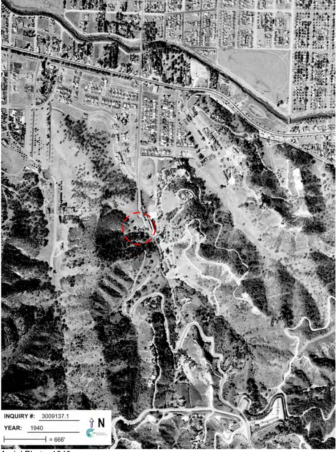
Aerial Photo, 1940