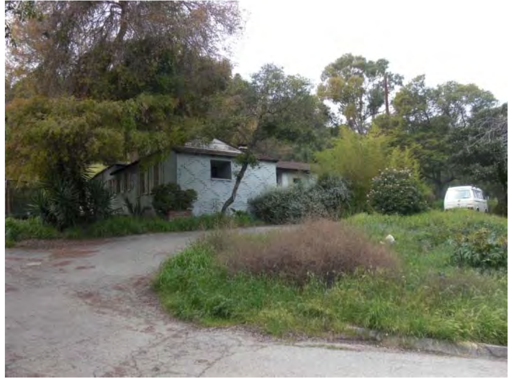
6. 3719 Coldwater Canyon street façade