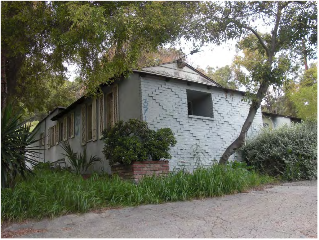
7. 3719 Coldwater Canyon south and east elevations